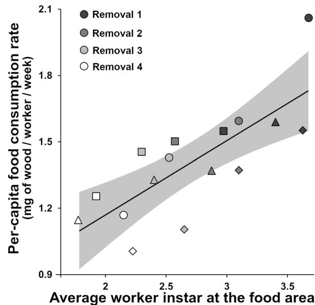
Figure 2. Per-capita food consumption rate (mg of wood consumption/number of workers in the colony/week) over average worker instar at the food area in Coptotermes formosanus colonies. The average worker instar was determined from each removal event by calculating the average from 40 individuals per colony. Square, circle, triangle and diamond shapes represent colony 1, 2, 3 and 4 respectively. Gray area and a solid line indicate 95% confidence intervals and regression line respectively.