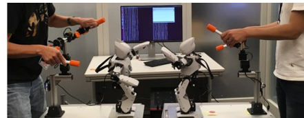
(a) Example of Human-Human Interaction

Our approach differs from previous works in three important ways. First, we used the neural network model [4] which can develop stochastic dynamics to deal with fluctuating sensory signals. Second, the other’s behavior is explicitly represented in our experiment. The previous studies [2, 3], however, used the XY coordinate of the ball as the input to represent other agent’s action, undermining communication. For instance, “attract” gesture in their studies were not, indeed, observed by another agent. Third, we examined the effect of the model parameters from the training process whereas the